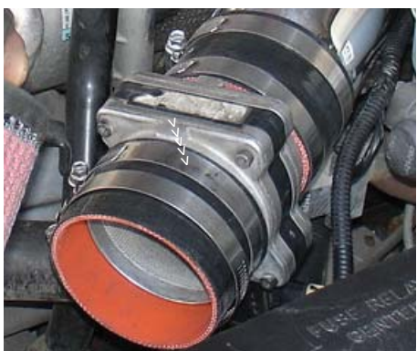
Press the remaining 3 1/4" straight hose over the end of the mass air flow sensor. Place two power-clamps on the sensor and tighten the clamp on the sensor side.