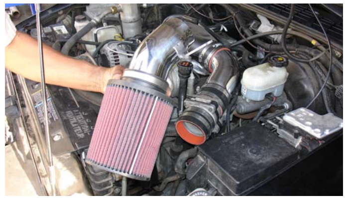
Place the assembled intake and filter into the engine compartment and align the intake to the mass air flow sensor. The intake bracket will also be aligned to the vibra-mount stud.