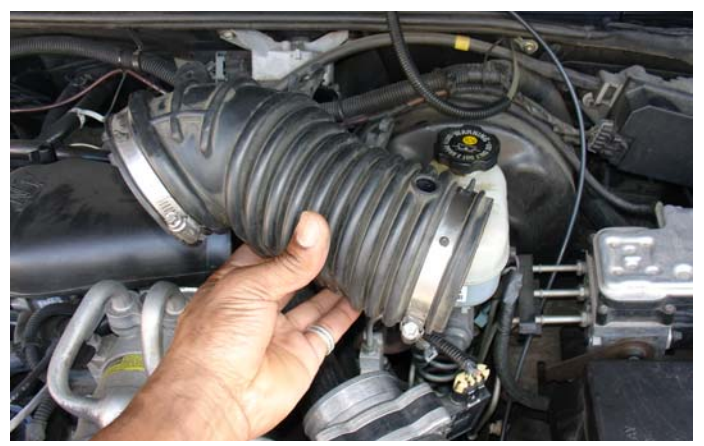
Disconnect and remove the air intake duct between the throttle body air inlet and the mass air flow sensor.