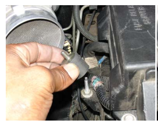
Take the female vibra-mount and screw the female end into the air box m6 stud as shown above.