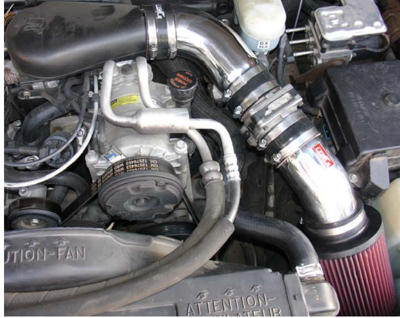
Congratulations! You have just completed the installation of the intake system. Periodically, check the fitment of the intake system and re-adjust the intake for best fit. Regular maintenance of the intake system will enhance the life of the system and prevent damage to the engine compartment. Enjoy the added performance of the intake system and most of all drive with safety in mind at all times.