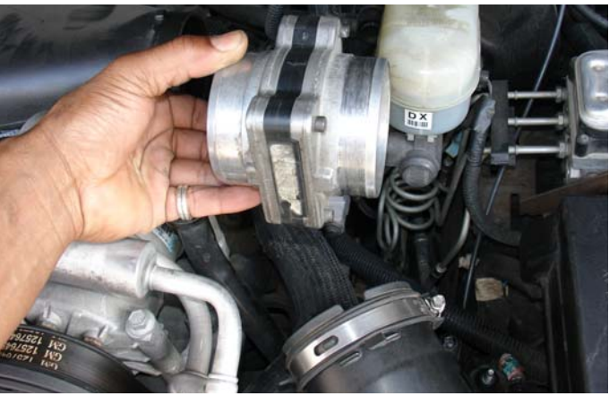
Loosen the last clamp and remove the mass air flow sensors shown above.