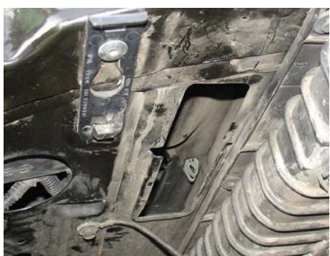
More clearance has been made for the new larger filter.