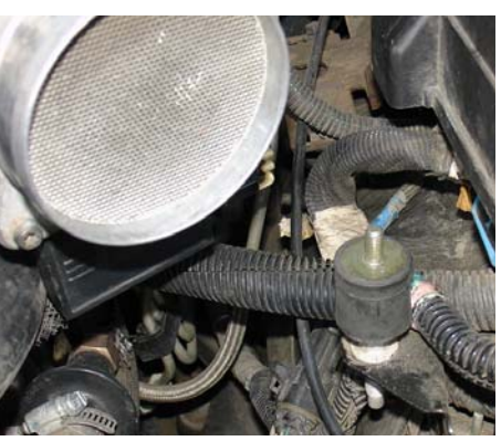
Screw the vibra-mount into the stud until it sit flush and firm.