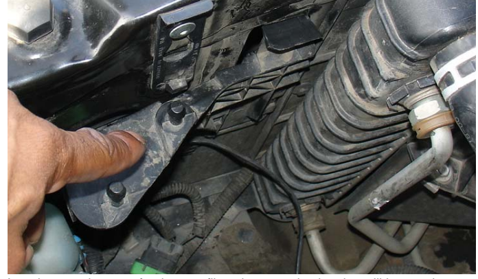
In order to make room for the new filter, the extension bracket will have to be removed.