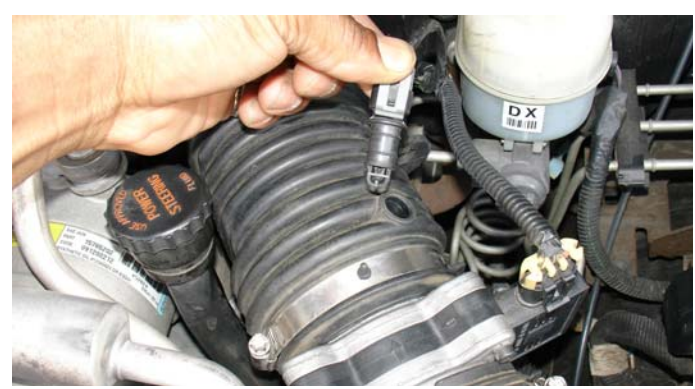
Air temperature sensor is removed from the air intake duct.