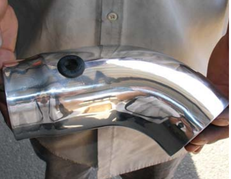
The grommet has been inserted and pressed flush into the primary intake hole.