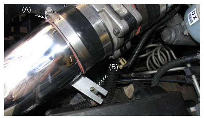
The secondary intake is pressed into the 3 1/4" hose located on the air mass sensor (A) while the intake bracket is lined up to the vibra-mount stud (B).