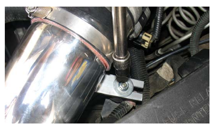
Use the m6 flange nut and fender washer to fasten the intake bracket to the vibra-mount stud.