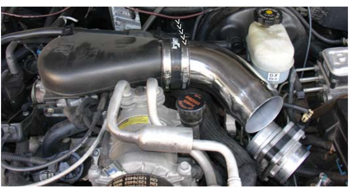
Press the primary intake into the 3 1/2" straight hose and semi-tighten the clamp at this point.