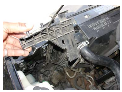
Retrack plastic pins in order to allow the bracket to become loose.