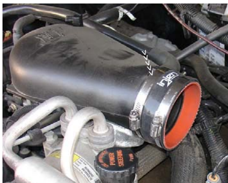
The 3 1/2" straight hose is pressed over the plastic air inlet elbow and two clamps are used. Tighten the clamp that is located on the elbow.