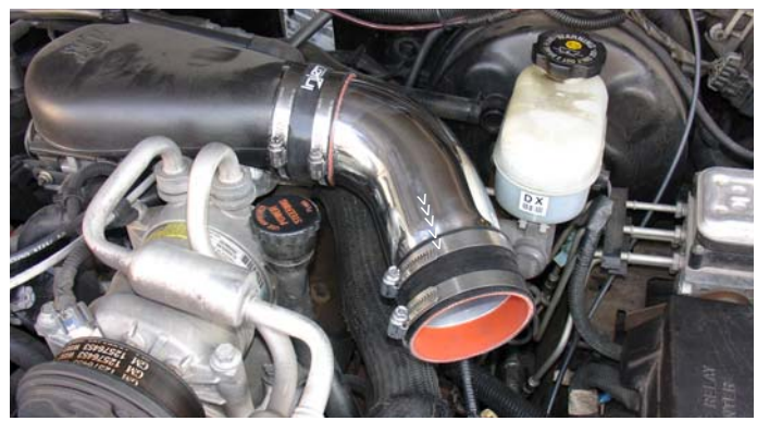
Press the 3 1/4" straight hose over the end of the primary intake and tighten the clamp that is located on the intake side.