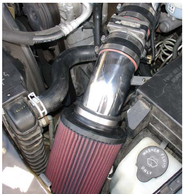
Align the entire intake for the best possible fit. Once the intake has been cleared from rubbing or moving parts continue to tighten all nuts, bolts and clamps.