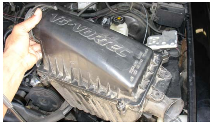
Pull the air intake box out from the grommets and remove the air intake box.