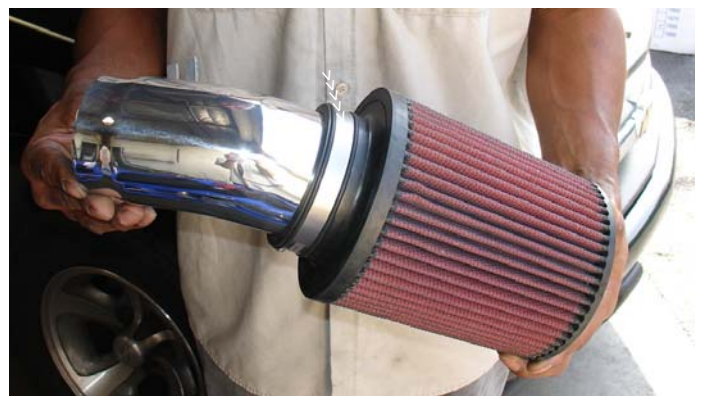
Press the 3 1/2" inverted filter over the end of the secondary intake. Press the intake into the filter until it butts up against the filter stops. Once the filter and the intake have been butted up continue to tighten the filter neck clamp.