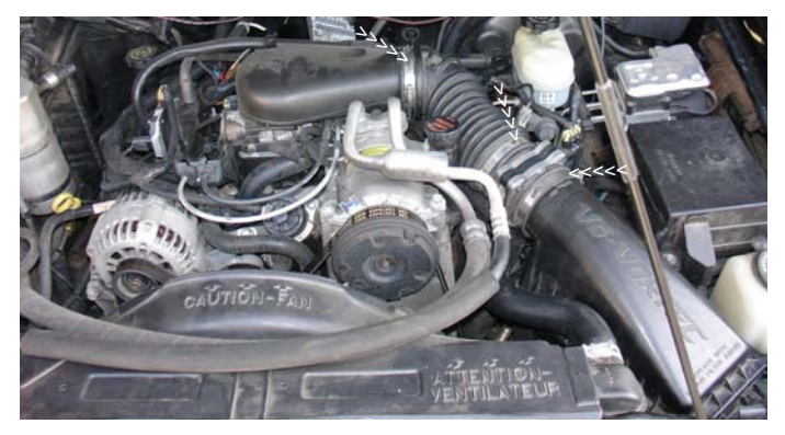
Loosen all clamps from the throttle body plastic air inlet to the mass air flow sensor.