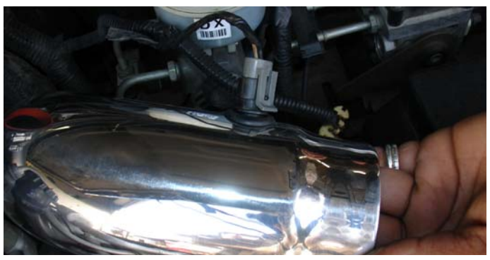
Prior to inserting the primary intake into the 3 1/2" straight hose, press the air temperature sensor into the grommet as shown above. The air temperature sensor will sit flush into the grommet.