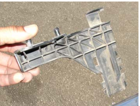
The bracket has been unhitched from the plastic pins and the bracket is now removed.