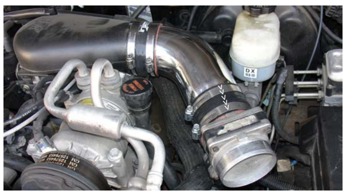
Press the mass air flow sensor into the end of the 3 1/4" straight hose as shown above, semi-tighten the clamp for now.