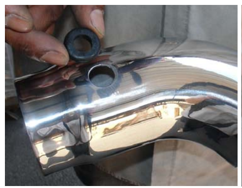
Align the grommet to the pre-drilled hole as shown