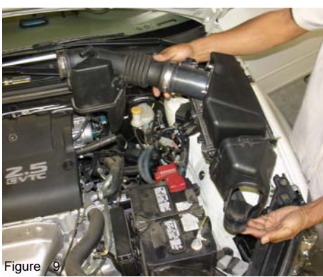
Once the clamps and bolts have been loosened, continue to remove the stock air intake box and air intake duct from the engine compartment,