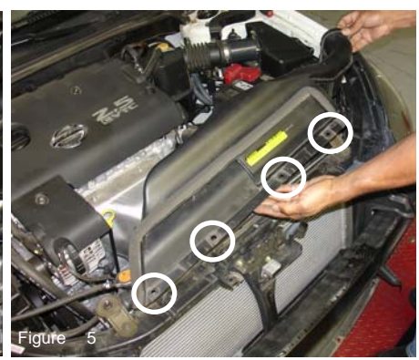
Remove plastic expanding plugs holding the front air scoop over the radiator. Once all plugs have been removed, continue to remove the air scoop.