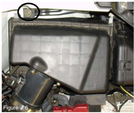
Remove the m8 bolt from the top corner air box cleaner that is connected to the fender wall bracket.