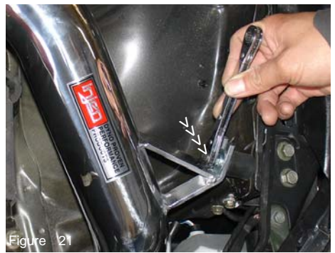
Use an m8 socket and ratchet to fasten the m6 flange nut to the vibra-mount stud.