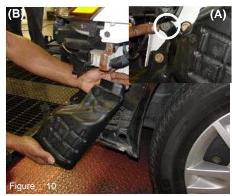
Once the bumper has been removed continue to unscrew the m6 bolt (A) Pull the air intake resonator box from the corner bumper below the head lamp (B).