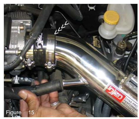
Press the crank-case breather hose over the end of the intake port.