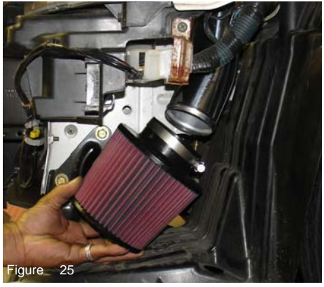
Align the filter to the end of the secondary intake until it sits flush on the end.