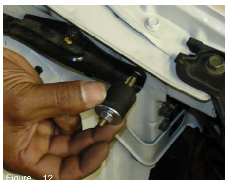
Take the vibra-mount and screw it into fender wall. Screw the vibra-mount into the fender wall until it sits flush with the bracket.