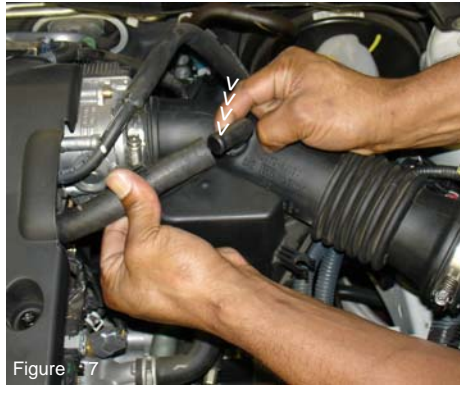
Disconnect the crank-case breather line from the air intake port as shown above.