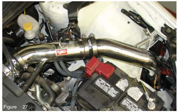
Align the entire intake for best possible fit. Once you have cleared the entire intake from any moving parts, continue to tighten all nuts, bolts and clamps.