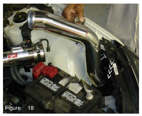
Carefully, lower the secondary intake into the resonator opening and into the bumper corner.