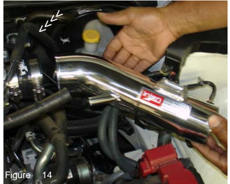
Insert the top end of the intake into the throttle body hose. Semi-tighten the other power-band just enough to hold the intake in place.