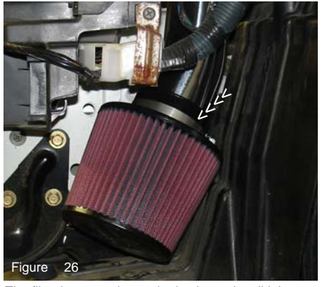
The filter is pressed over the intake end until it butts up against the filter stops. Once the filter is pressed up against the intake end, continue to tighten the filter neck clamp.