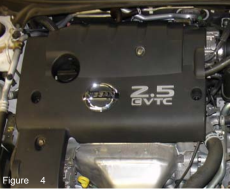
Remove the four m6 bolts that secure the engine cover over the intake manifold. Once all bolts have been removed, continue to remove the engine cover.