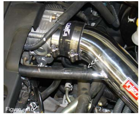
Once you have pressed the stock breather hose over the intake port, continue to slip the tension over the intake port and hose.