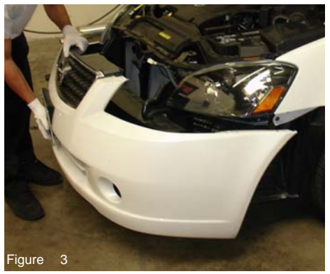
Remove 9 clips on top of the bumper, two 10mm screws on each side of the bumper, four additional sheet screws and 5 plastic clips.