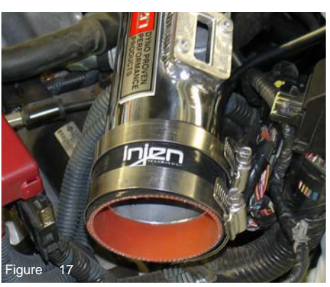
Press the 3" straight hose over the end of intake and tighten band located on the intake side. The second band is not tightened yet (A).