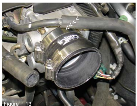
Press the step hose over the throttle body and use one .362 and one .312 power-band on the step hose. Tighten the .312 power-band located over the throttle body.