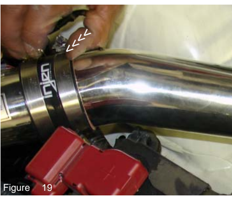
Carefully insert the top end of the intake into the 3" straight hose located over the end of the primary intake.