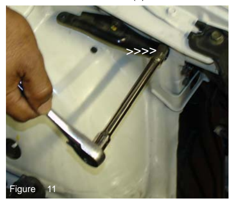
Remove one of the stock bolts located on the air box bracket. to make room for the m6 vibra-mount. New location for the vibra-mount (A).