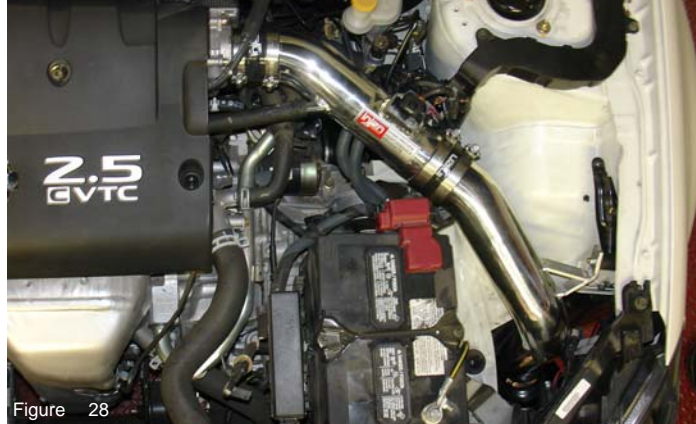
Congratulations! You have just completed the installation of The World's First Tuned Intake. Periodically, check the cold air for fitment in order to avoid any damage to your intake.