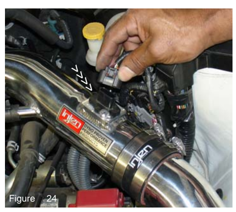
Press the electrical sensor clip over the mass air flow sensor until it snaps in place.