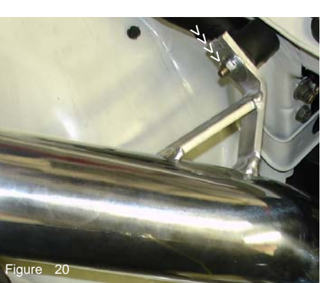
Once you have lowered the intake into the bumper area, continue to align the intake bracket to the vibramount stud. Place the m6 flange nut and fender washer over the vibra-mount stud.