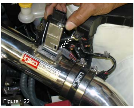
Insert the stock mass air flow sensor into the machined sensor adapter. Place a dab of light oil on the O-ring to prevent it from tearing or kinking.