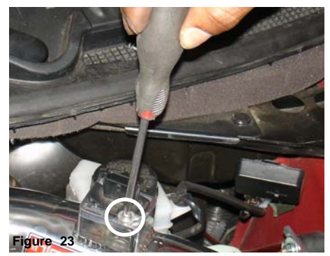
Use the stock screws to secure MAF sensor to the MAF sensor adapter.