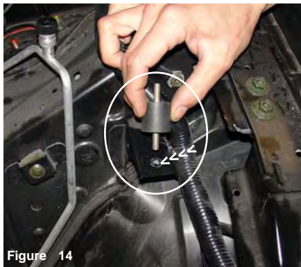
Figure 14 The vibra-mount is screwed into the fender well air box bracket as shown above.