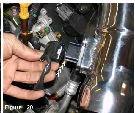
Figure 20 Press the electrical harness clip over the mass air flow sensor. A firm snap is a sign of a good connection of the two devices.