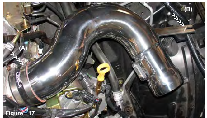
Figure 17 The intake is pressed into the throttle body hose (A) while the intake bracket is aligned to the vibra-mount stud (B).