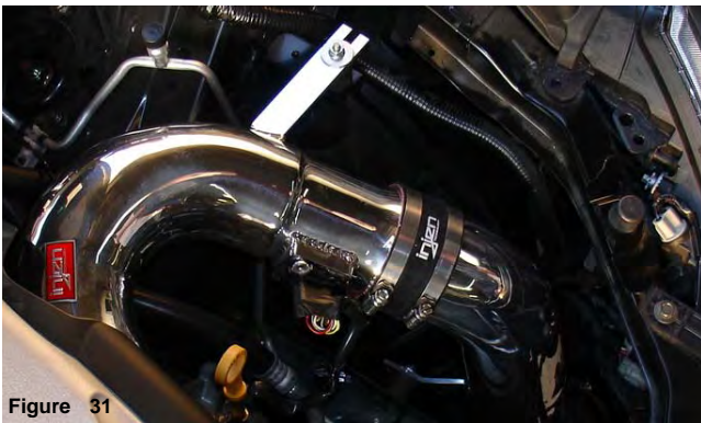
Figure 31 align the entire intake for the best possible fit. Once the entire intake has been checked and cleared for any possible rubbing or rattling, continue to tighten all nuts, bolts and clamps.