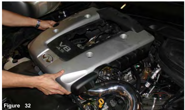
Figure 32 Once all nuts, bolts and clamps have been fastened, continue to replace the front air scoop, side cover and engine cover. Periodically, check the fitment of the entire intake system for any shifting that may cause damage.