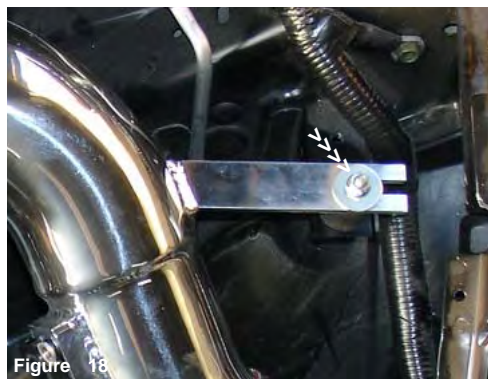
Figure 18 The m6 flange nut and fender washer is used to fasten the intake bracket to the vibra-mount stud.