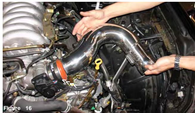
Figure 16 The primary intake is lowered into the engine compartment while the top end is pressed into the throttle body hose.