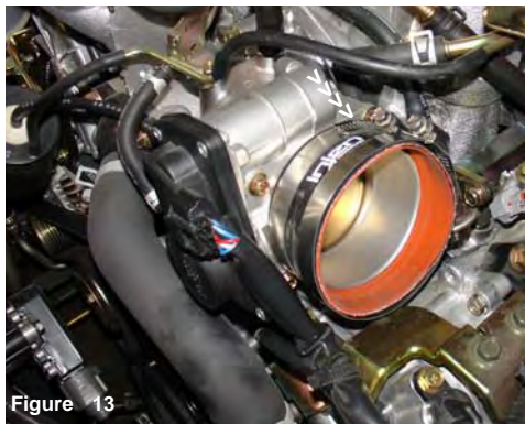
Figure 13 Press the straight hose over the throttle body and use two power bands. Once the hose has been placed over the throttle body, use a nut driver to tighten the power band on the throttle body side.