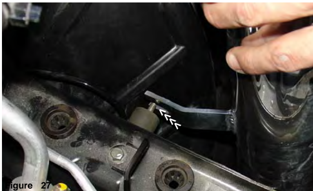
Figure 27 align and set the intake bracket over the vibra-mount stud. Press the top end of the secondary intake into the hose located on the primary intake.