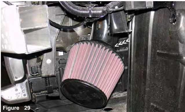
Figure 29 Press the filter over the end of the secondary intake. Once the intake has been butted to the filter stops, continue to tighten the filter neck clamp.