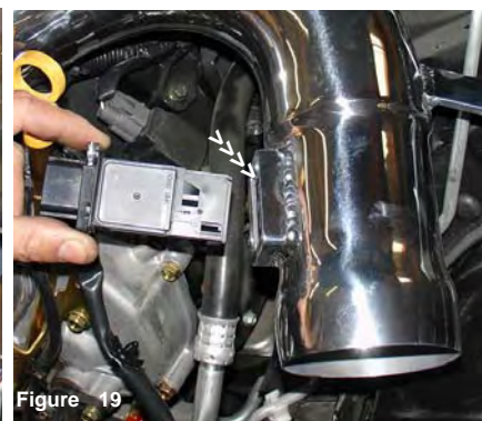
Figure 19 Insert the mass air flow sensor into the machined adapter. Once the mass air flow sensor has been butted up to the adapter, continue to use the stock screws to fasten the sensor and adapter together.