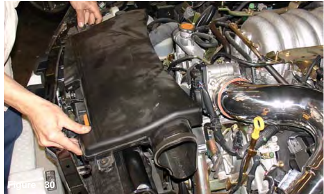
Figure 30 Replace the front air scoop back to its original position once the intake has been installed.