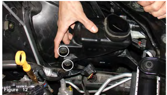
Figure 12 Pull the resonator box out of the grommet pins used by the resonator box. The resonator box will not be used as part of this installation.