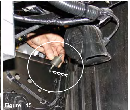
Figure 15 The second vibra-mount is screwed into the pre-tapped hole located on the main frame.