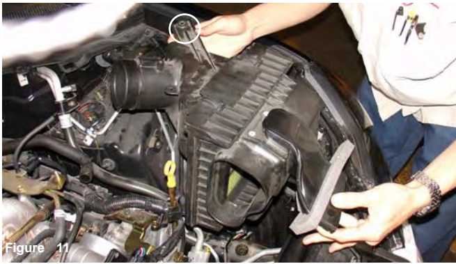
Figure 11 Remove screws used to hold the air box cleaner in place. Once screws have been removed, continue to pull the entire air box cleaner out of the engine compartment.